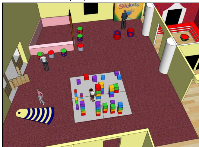
Create-a-Cityscape in ArtVille